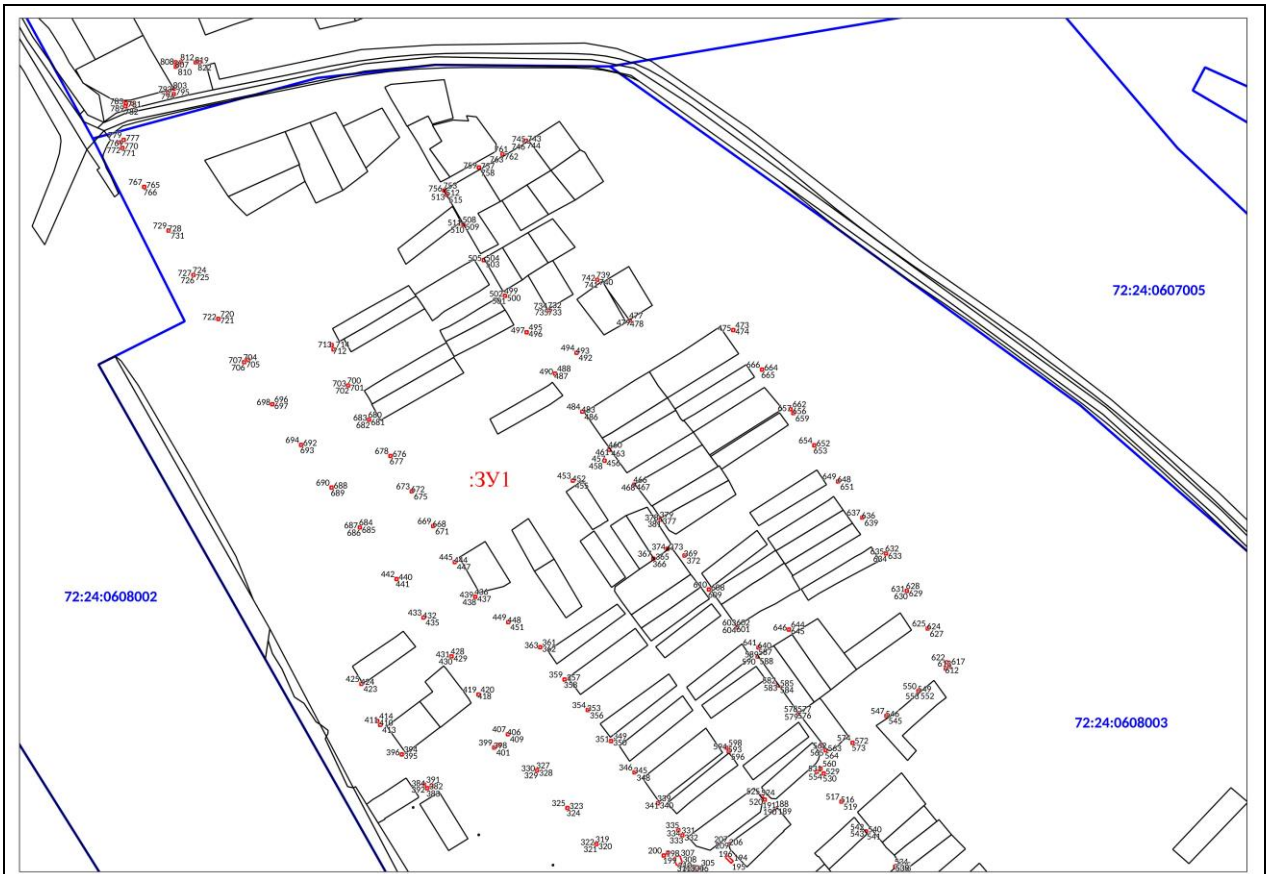
Мащтаб 1: 3000